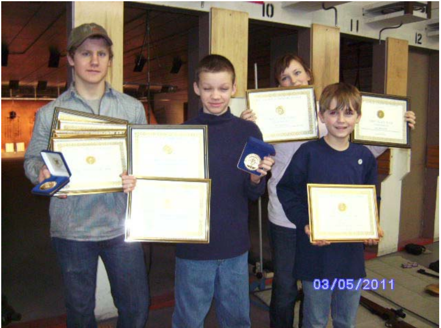
Photo of Winners of NRA 3-Position Sectional Match held at Albany Rifle & Pistol Club